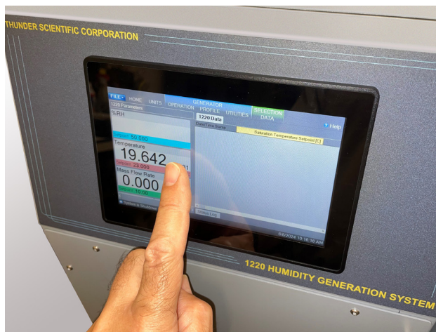
Multi-point Touch Screen for quick and easy data inputs.

Calibration: Proper calibration of the temperature and pressure transducers ultimately determines the accuracy of the generator. The humidity generator employs an integrated software calibration scheme allowing the 1220's probes and transducers to be calibrated while they are electrically connected to the humidity generator. Coefficients for each transducer are calculated by the computer and stored to memory.