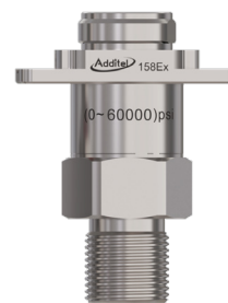
"ADT158Ex pressure module - for use with ADT260Ex (bottom mount)"