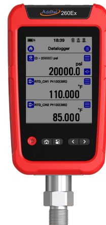
Additel 260EX with ADT158Ex module