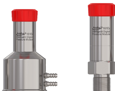
"ADT161Ex pressure modules - See ADT161 Datasheet for more info"

[1] For custom RTD cable lengths over 100 feet (30 meters), which will adhere to Class B, please contact Additel.