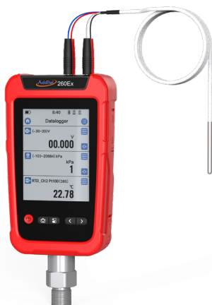
ADT260Ex with AM1602 temperature probe

Note: The ADT260Ex can be purchased without the ADT158Ex module If needed using the following part number: ADT260EX-NO