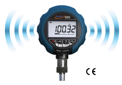
680 with data logging and wireless (opti